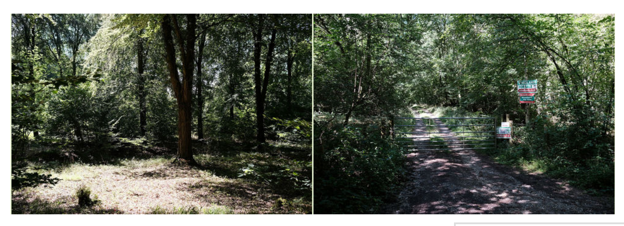
Bentley Wood is a secluded mixed broadleaf woodland situated in the North Wessex Downs AONB.

At just under 4 acres Bentley Wood is a very manageable size, perfect for those considering owning their own woodland.