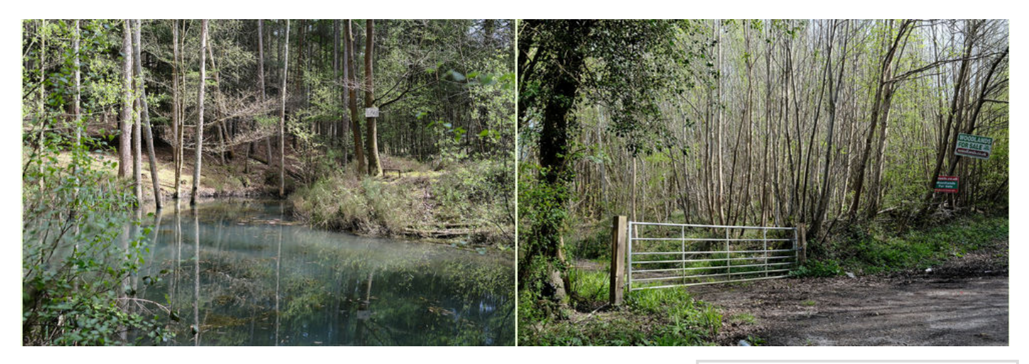
Pennywort Wood offers a rare opportunity to own a large well-mixed woodland in the High Weald AONB.

The woodland boasts fantastic features including a stream fed by a natural spring and a picturesque pond. Over the years, the site has been thoughtfully utilized, boasting pre-existing shelter, storage facilities and a charcoal kiln.